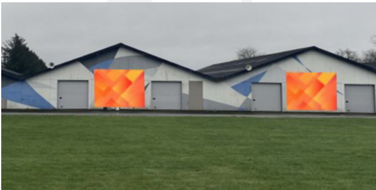
Buildings for lounge exhibition areas.